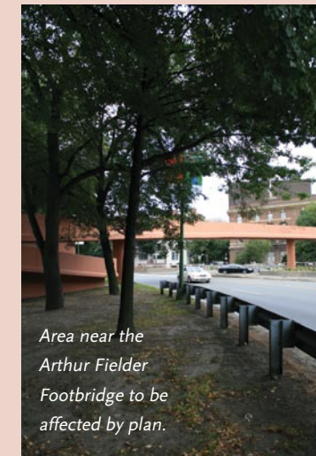
Area near the Arthur Fiedler Footbridge to be affected by plan.

The Commissioner also informed the committees that DCR is leaning towards recommending option A, the rehabilitation of the existing tunnel. This option maintains the existing configuration of the Esplanade and Storrow Drive while replacing the Arthur Fiedler footbridge with a new ADA compliant structure. The project is estimated to take a minimum of 2.5 years to construct and cost approximately 52 million dollars.