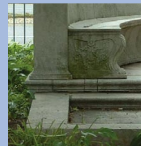
Where on the Esplanade? See inside...