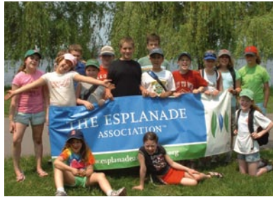
Kingsley Montessori School volunteers

♻️ PRINTED ON RECYCLED PAPER 50% Post-Consumer Waste